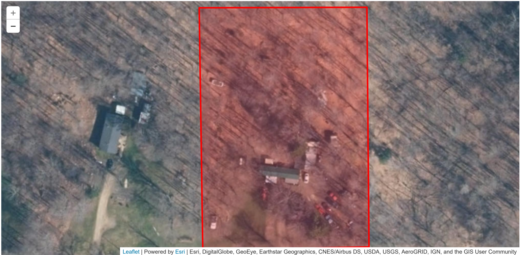
Leaflet | Powered by Esri | Esri, DigitalGlobe, GeoEye, Earthstar Geographics, CNES/Airbus DS, USDA, USGS, AeroGRID, IGN, and the GIS User Community